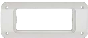
Large Flush Mount Bracket - Suit GX400 / GX700 - White