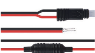
12V DC Power Lead - Suit GX600 / GX600D