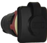
8pin Flush Mount Microphone Socket - Suit GX750 - Black