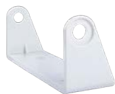
Mounting Bracket - Suit GR200 / GX300 / GX600 - White