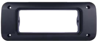
Large Flush Mount Bracket - Suit GX400 / GX700 - Black