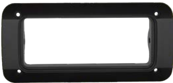
Flush Mount Bracket - Suit GX400 / GX700 - Black