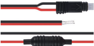
12V DC Power Lead - Suit GX300 / GX400