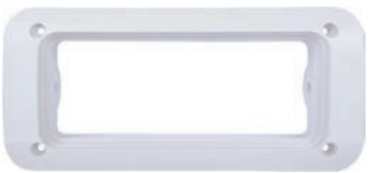
Flush Mount Bracket - Suit GX400 / GX700 - White