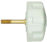
Thumbscrew - Suit AE346x