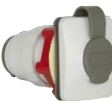
8pin Flush Mount Microphone Socket - Suit GX750 - White